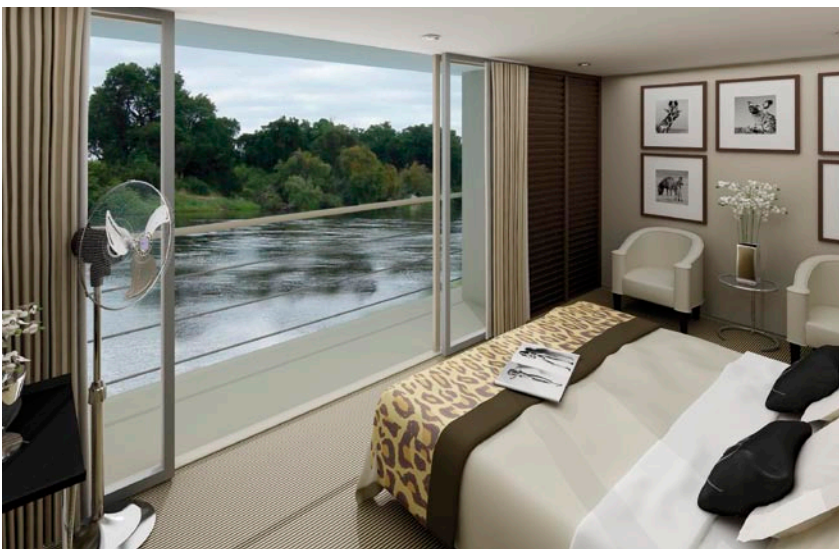
The Zambezi Queen "hotel boat" puts the raw wilderness of Africa right on the deck of your own private suite.

Situated on the third level with unobstructed views on three sides,