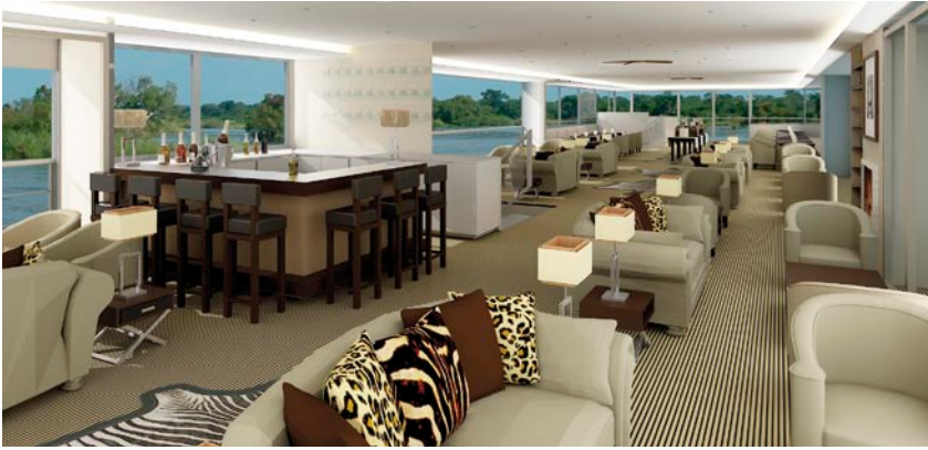
The third-level, luxurious dining room offers guests unobstructed views and delicious meals whilst taking in the picturesque African surroundings.

board games. There is also a computer facility with Internet and a curio shop. The remainder of the first- and the entire second level contain 10 suites and four master suites.